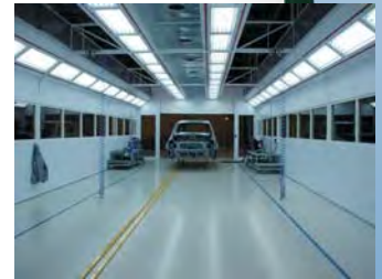
Industrial Inspection Station