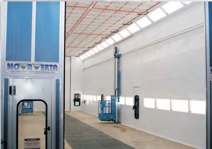
Horizontal Lighting Package