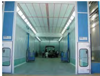
Side Downdraft Electric Roll Door