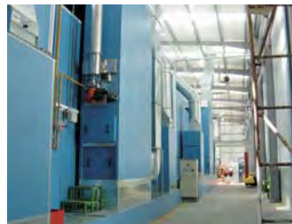
Narrow Makeup Air Units