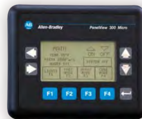
Standard Touchpad 300