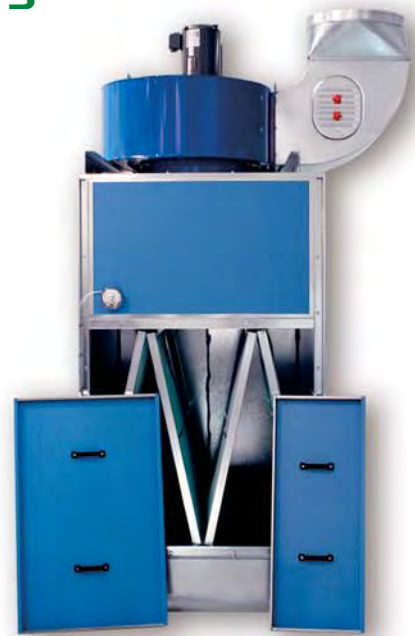
Post Filtration System (Optional)