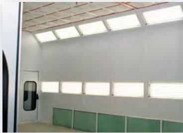
Side Downdraft Wall