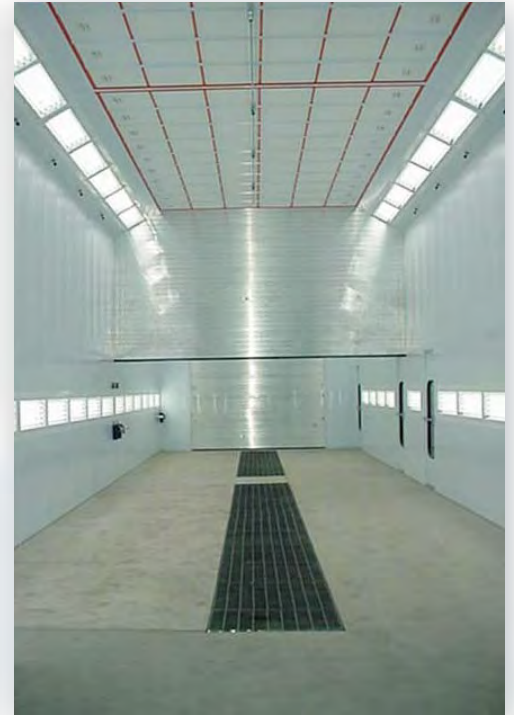
Center Dividing Door