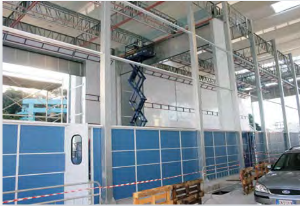
Tubular Framing Super Structure