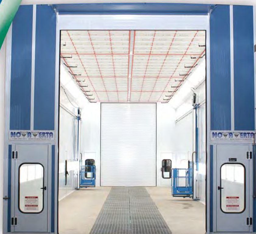
Via Metro - San Antonio