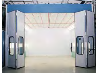
Side Downdraft Bifold Open