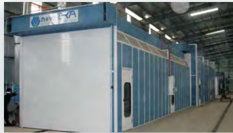
Industrial Tunnel Booth

booth cabin pressure, minimizing air turbulence, and promoting cleaner paintwork, which can reduce cutting and polishing.