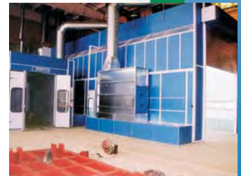
Rail Parts Booth