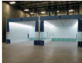
Rear Wall Exhaust Prep Areas