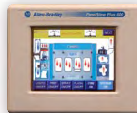
Optional Touch Screen 600C