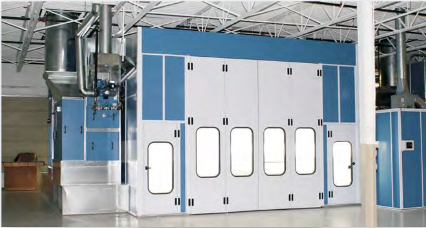
Side Downdraft Bifold Front