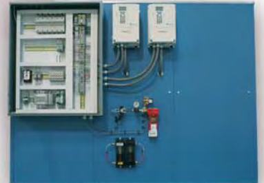
Pre-Wired Finger Safe Controls VFD is Rated NEMA 4X