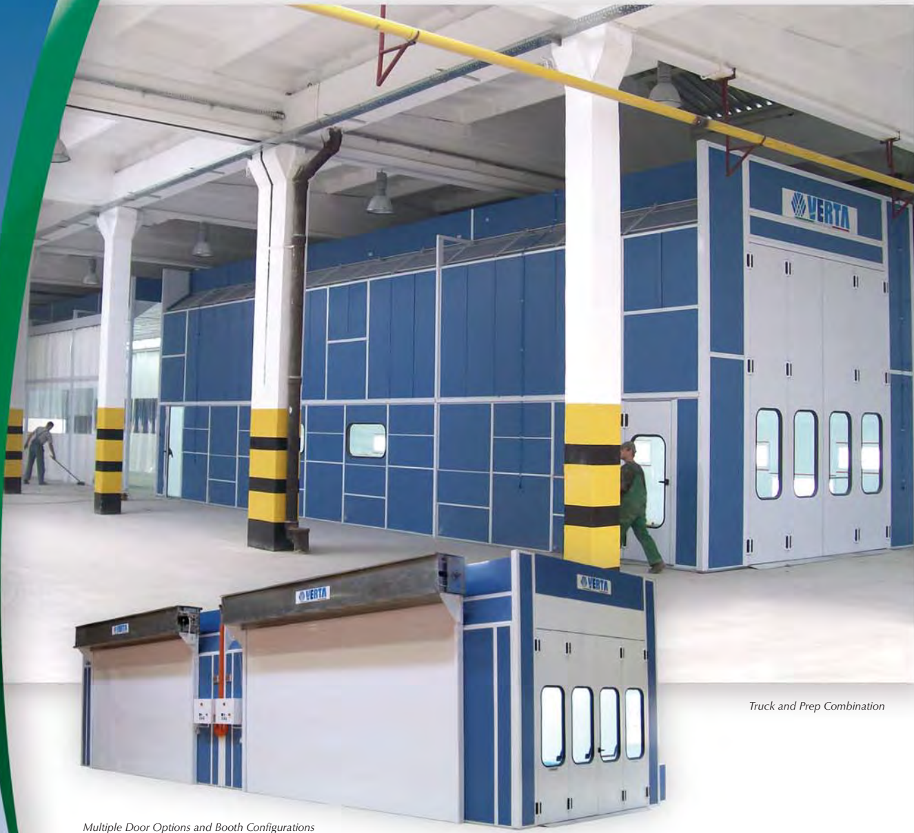
Truck and Prep Combination