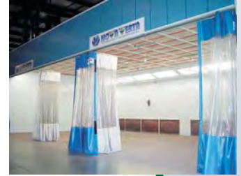
Truck Semi Down CTOF