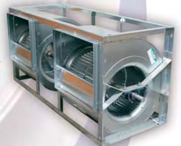
Twin Dual Inlet Hi-Capacity Low DB (Make up air fans)