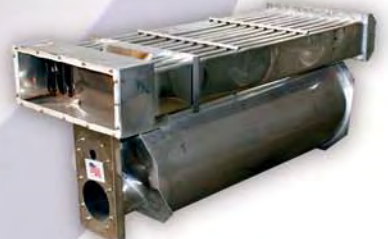
304 Stainless Steel Heat Exchanger